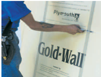
Use a circular saw, utility knife or hot knife to make accurate cuts where you need them.