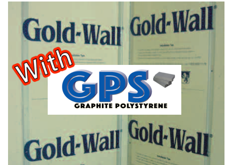
Minor in the field trimming offers the ability to easily float inside drywall corners.