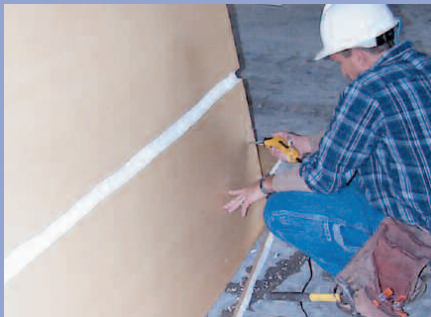
There is no steep learning curve when using Gold-Wall. Voiding out for conduit or cutting out penetrations can be done with a hot knife or common tools.