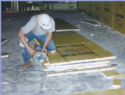
Gold-Wall cuts easily with common tools.