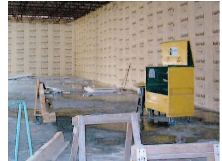
Stud spacing remains accurate, panel to panel, with stud spacing at 16 or 24 inch centers.