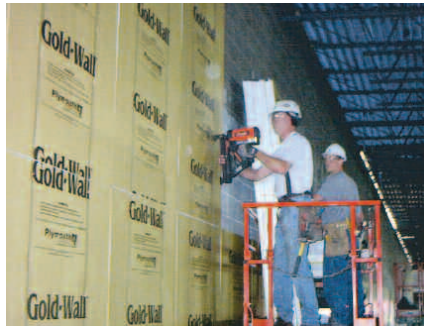
Because Gold-Wall comes in panels with built-in studs, installation is FAST, EASY and ACCURATE.